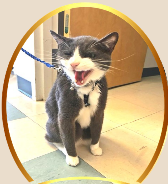
★ Sheldon ★