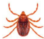
BROWN DOG TICK

These eggs hatch in July, and the life-cycle starts again when larvae become active in August. Typically, about 50% of adult blacklegged ticks are infected with Lyme bacteria.